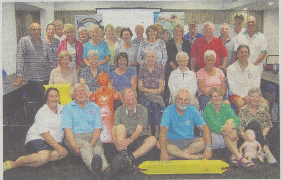
WATER WISE: Participants in the Grey Medallion Life Saving Course.

"I feel now I could really make a difference especially in an emergency situation," a participant said.