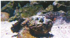
OUCH: Stone fish stings are painful.