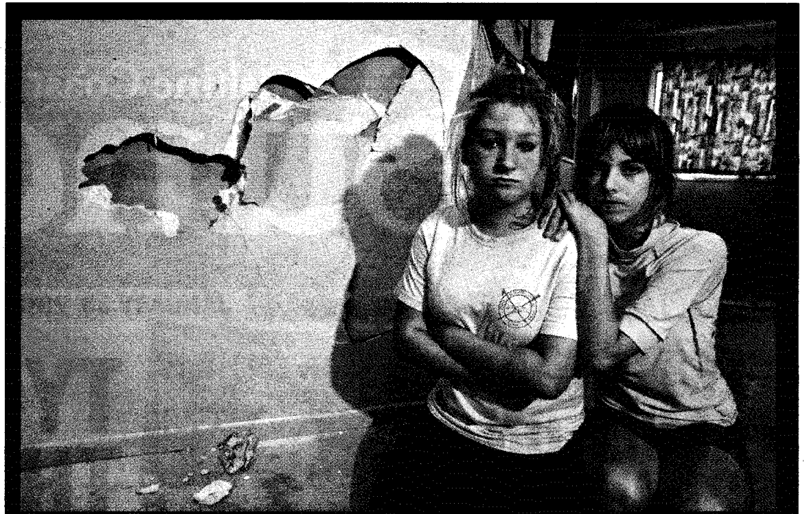
SENSELESS ACT: Vandals targeted the Ithaca Caloundra City Life Saving Club at Happy Valley, Caloundra on Friday night.