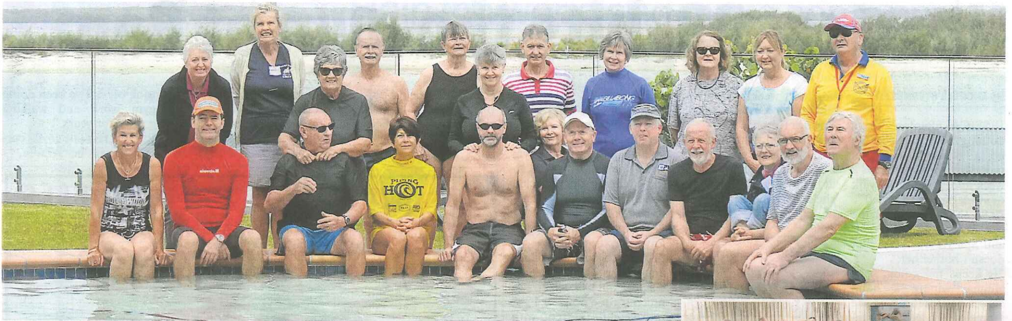
VITAL SKILLS: Forty seniors took a Grey Medallion lifesaving course at BreakFree Grand Pacific Caloundra.