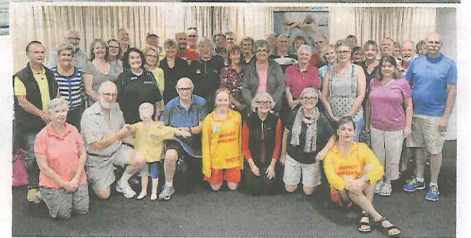
The course was designed for over-55s.